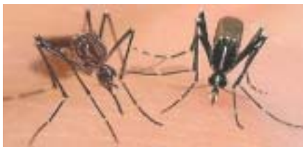
Figure 2: Major dengue vector: Aedes aegypti and Aedes albopictus

Two mosquito species are particularly important vectors for the spread of Dengue fever, Aedes aegypti and Aedes albopictus , also known as the dengue mosquito and Asian tiger mosquito, respectively. Within 8-12 days of biting an infected person, a mosquito is able to transmit dengue to other people. As more people are infected, more mosquitoes become infected by dengue virus and further transmit the disease (Figure 2).